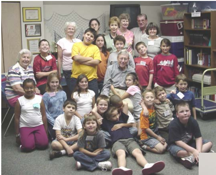
At right is a photo taken in our new computer lab, located at 50 S. Yonge Street (across from Sparkle and Shine Car Wash) in Ormond Beach.